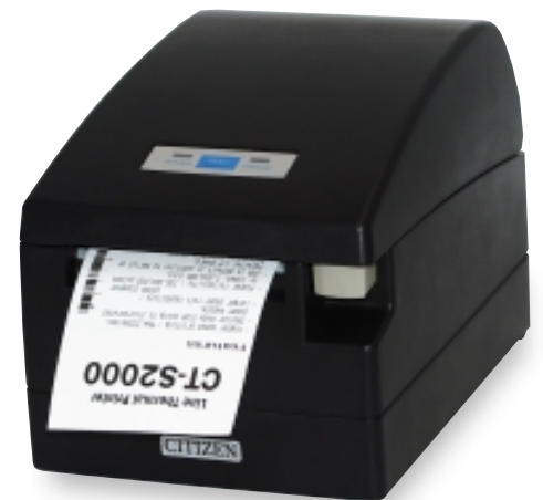
Available in black